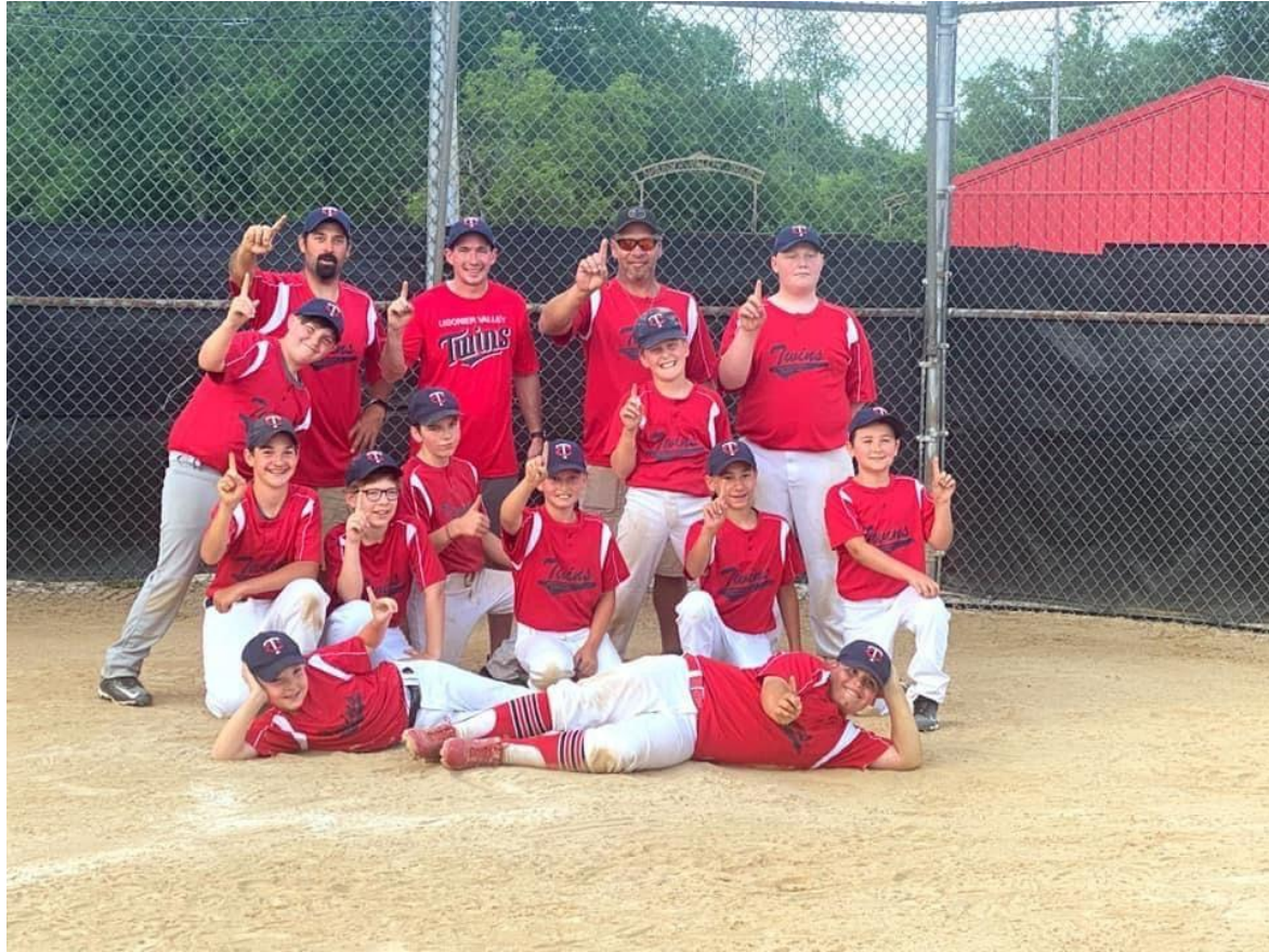
Twins – Champions Friday, June 25, 2021